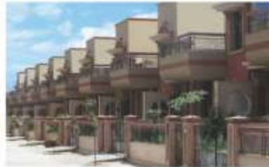
SHRI RADHAPURAM ESTATE