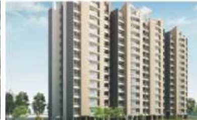
SHRI RADHA VALLEY