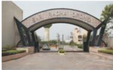
SHRI RADHA ORCHID