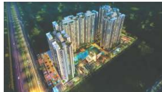
SHRI RADHA AQUA GARDENS