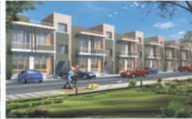
SHRI RADHA TOWN