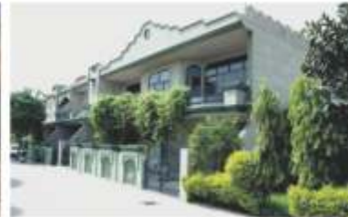
SHRI JAMUNA DHAM