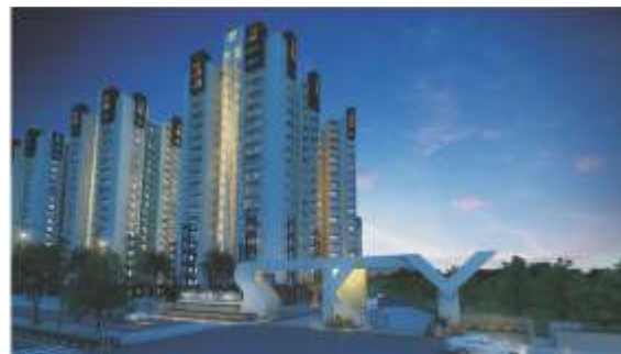
SHRI RADHA SKYGARDENS