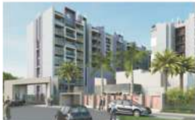
SHRI RADHA NRI GREENS