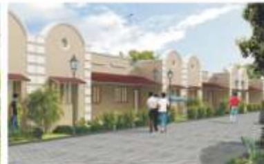
SHRI RADHA GOLF