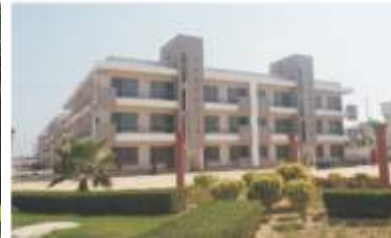
SHRI RADHA CITY